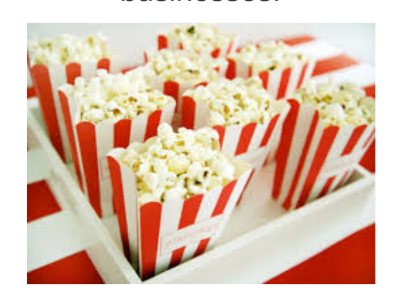
*NDS has a variety of À La Carte products available, all of which meet Smart Snack regulations. NDS charges the school by the full case of snacks, and schools can choose their own pricing for resale.

*Make fundraising planning a team effort by including students, teachers, families, local community groups, and businesses.