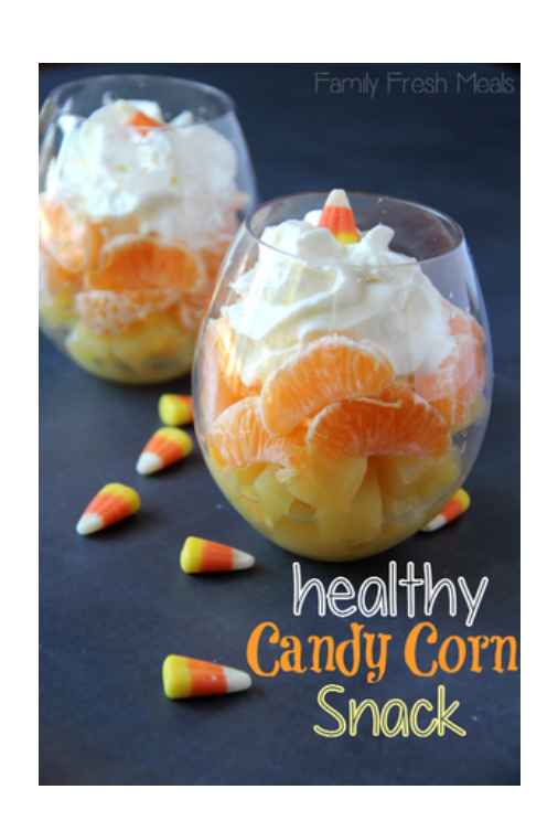
Candy Corn Fruit Cocktail

Ingredients -Pineapple and oranges, cut into bite sized chunks -whipped cream -candy corn